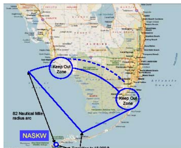
Figure 3. Location of the ACES field campaign. The 82 nautical mile radius represents the range at 50,000 ft altitude allowed by GA-ASI. With favorable winds the range could be extended at the pilot’s discretion (e.g., dashed line on map)

Thunderstorm activity in Florida near the Everglades peaks during the summer months. Not unexpectedly, the greatest frequency of thunderstorm occurrence is in summer afternoons between 13–18 local standard time (LST). The climatological number of thunderstorm days for the Everglades area is about 12-15 days for August. Figure 4 shows the actual lightning statistics for the ACES domain during the August 2002 campaign. These data also show that during this period thunderstorms occurred on more than 20 days during the month, which is better than the climatologic mean.