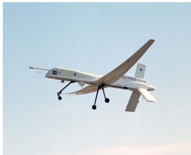
Figure 1. The Altus taking off with the ACES payload to go monitor thunderstorms

There were two primary demonstration goals in the ACES project that were successfully addressed. First, by exploiting the unique capabilities of Altus, the ACES project demonstrated the utility and promise of UAV platforms for investigating